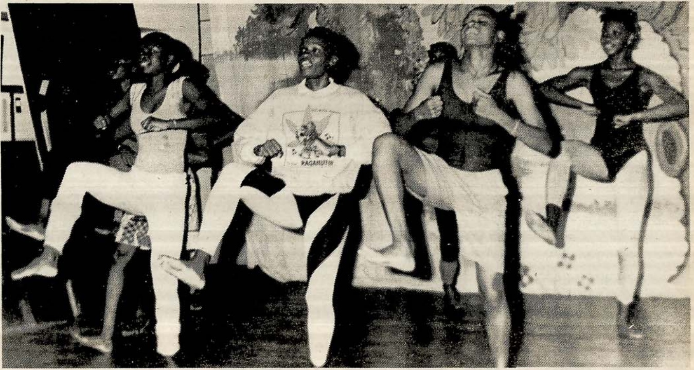
COOPERATION is needed to see us through, says this dance movement from the production Dedication .