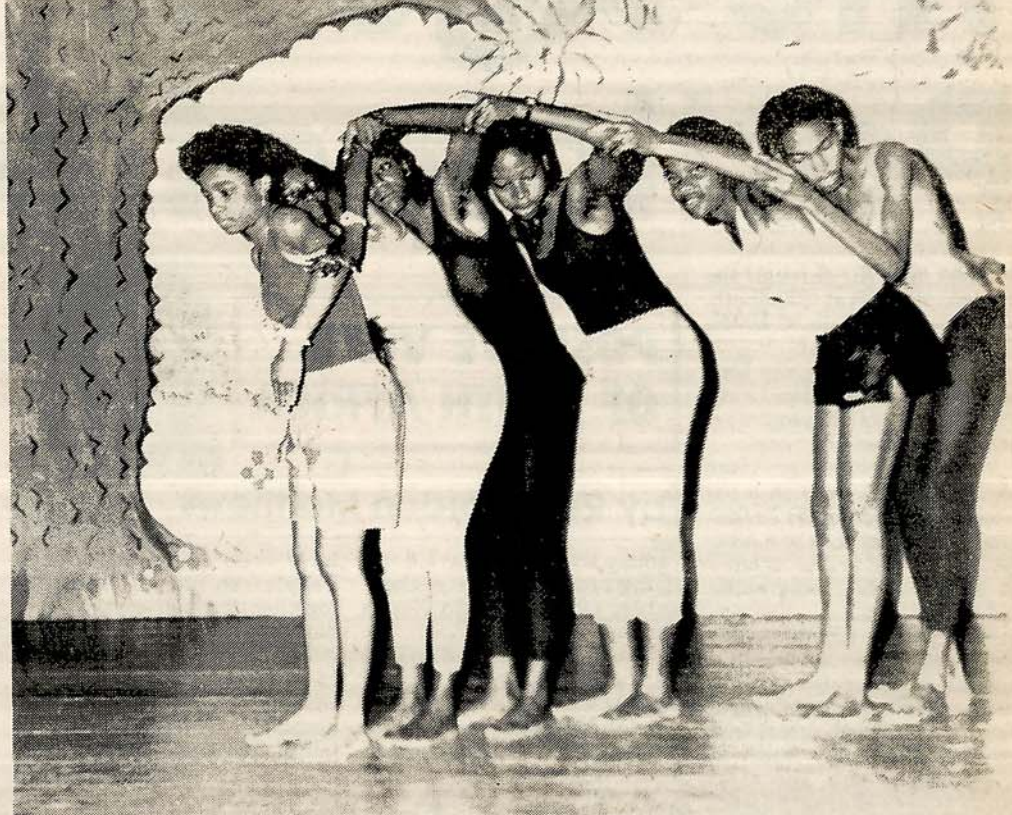
A dance of struggle and determination. One of the pieces to be featured in the production Dedication .