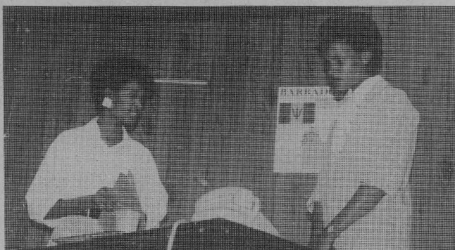
Something to think about for these actors in the play Interview .