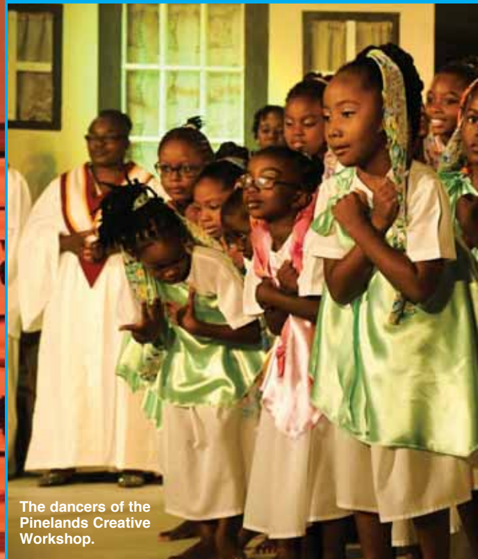
The dancers of the Pinelands Creative Workshop.